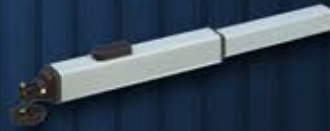
IDRO 39: MAX GATE WEIGHT OF 1,000 KG

Manufacturer reserves the right to change product design without prior notice.