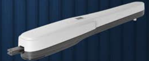
King Evo: Max gate weight of 400 kg