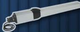
IDRO 27: MAX GATE WEIGHT OF 700 KG