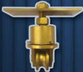
D56 WHEEL FOR BIFOLDING GATES